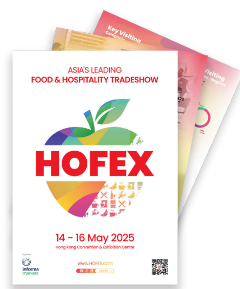
Exhibit Now 立即參展

Are you looking for an excellent platform to highlight your competitive advantages and boost brand visibility ? Secure your stand at HOFEX 2025!